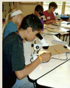
Be a Summer Earth Assistant and help kids discover nature!

Love nature and kids and want to be outside in the summer? If you are 14 or older, consider sharing your enthusiasm and passion as a Summer Earth Adventures Assistant! This is a wonderful opportunity for youth to complete school, honor society or organizational volunteer service requirements or for anyone looking for resume building skill sets and experience!