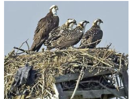
Osprey with young on platform nest