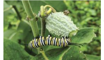
Monarch caterpillar on Milkweed