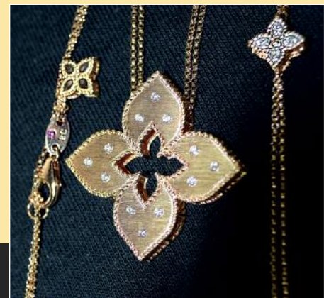
Donated by James Free Jewelers

In 1996, Roberto Coin began signing his jewels by setting a small ruby hidden on the inside of each piece, where it would touch the skin of the wearer. This is now the exclusive signature of every jewel by Roberto Coin.