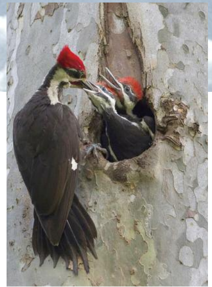
Pileated Woodpecker feeding young in a cavity nest

Scrape nests: These are the simplest kind of bird nest. Scrape nests are often just a shallow depression and sometimes contain small stones, leaves or feathers. Species that make scrape nests include Killdeer, Northern Bobwhite and Turkey Vultures.