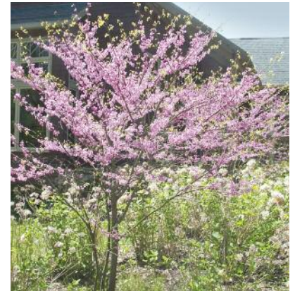
Redbud in bloom