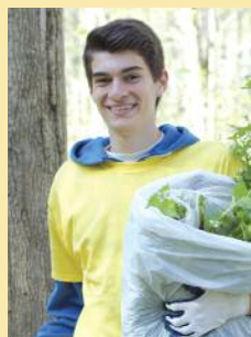
Removing invasive plants such as garlic mustard helps habitats.

April 27, Saturday: 9 a.m.-12 p.m. Enrich woodland, wetland and prairie habitats to support birds and pollinators like butterflies and bees! Volunteers will plant native wildflowers and grasses in various habitats, while some may remove invasive plants such as garlic mustard. Gloves and trowels provided. Complimentary lunch is provided from 12-1 p.m. and each volunteer will receive a native plant to take home. Sign up at: