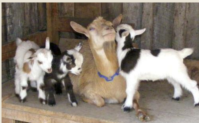
Nigerian dwarf mother and kids

for everyone to enjoy! Explore free children's activities with games, crafts, balloons and face painting. Take a chance on our 50/50 raffle and find wonderful items to buy from our talented craft vendors. Meet and learn about several local nonprofit organizations.