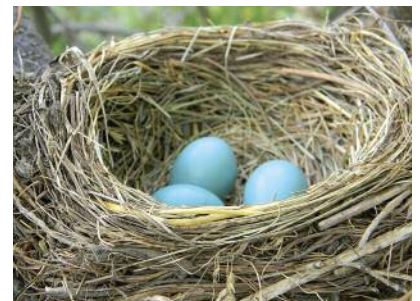
American Robin cup nest with eggs