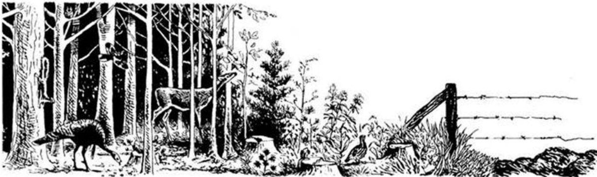
This illustration shows the gradual transition from forest to fields achieved through edge feathering, which benefits bobwhites and other wildlife. Illustration courtesy of University of Missouri Extension.

The quail's saving grace is appropriate habitat. When quail fly and land, they run for cover, and the thicker and thornier, the better. Successional habitat — sometimes called “feathering” — benefits both Bobwhite Quail and other wildlife. If you have land with a forest edge, or agricultural fields, consider adding an edge of trees and shrubs such as plum, hazelnut, elderberry, dogwood, and blackberry, then forbs such as partridge pea and coneflower, and finally grasses such as big and little bluestem, switch grass and prairie dropseed.