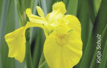
Yellow Flag Iris

The best way to tackle a Yellow-Flag Iris invasion is early detection and removal. Since this is the only species of yellow iris that grows wild, you can be confident that any new yellow iris is this invasive. Quickly remove any new plants. The best removal method is digging the plant, taking care to remove as many of the rhizomes as possible. Discard the plant and soil in the trash; composting will likely result in accidental reintroduction. Continue removing in the same area for several years to fully eradicate the plant. Yellow-Flag Iris can also be removed with a 2-4% glyphosate treatment to the leaves (the exact concentration depends on the solution used). However, you must use glyphosate that is approved for aquatic use or you could kill all living things in the water, both plants and animals (regular Round Up, which can be purchased at most box stores, is not safe for aquatic use).