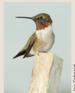
Male Ruby-throated Hummingbird