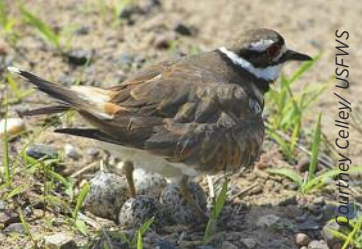
Killdeer eggs in a scrape nest