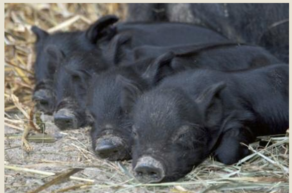
Guinea hog piglets