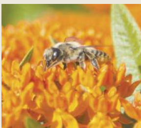
Bee pollinating butterfly milkweed