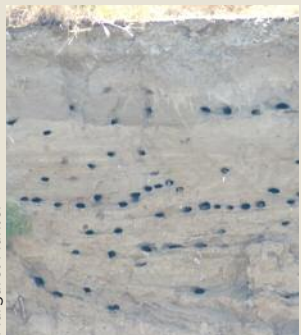
Bank swallow burrow nests