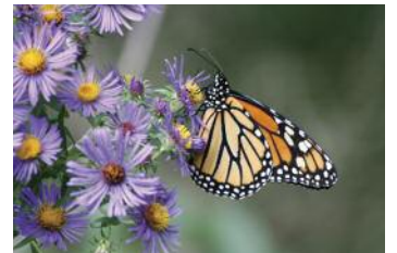
Monarch on New England Aster