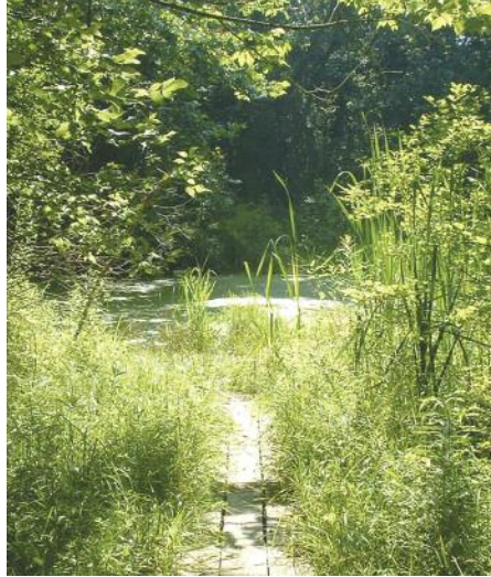
Boardwalk leading to Muskrat Marsh

Thursdays, May 2, 9, 16, 23, 30 from 8:00-9:30 a.m. Enjoy a weekly walk along Aullwood's trails to explore the wonderful seasonal changes taking place at Aullwood. Bring binoculars! (Center)