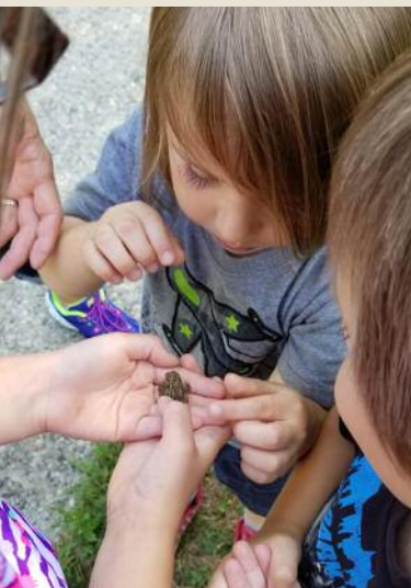
A tiny toad