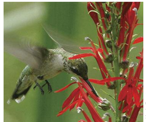
Hummingbird drinking from Cardinal flower

Sundays, April 7, 14, 28 starting at 2:30 p.m. During the month of April, Aullwood's wildflower trail is full of colorful spring flowers. Bloodroot, trillium, Virginia bluebells and celandine poppies carpet the woodland floor. Discover wildflowers with us on a spring walk at Aullwood! (Center)