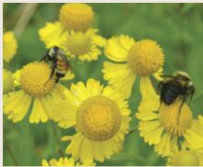
Tri-colored and brown- belted bumble bee on sneezeweed