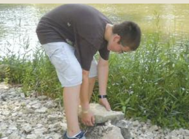
Checking out rocks