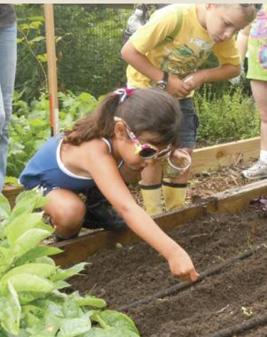
Planting in the Farm garden

We are unable to accept registrations online. To register for classes call Aullwood at 937-890-7360 or register in person at the Nature Center.