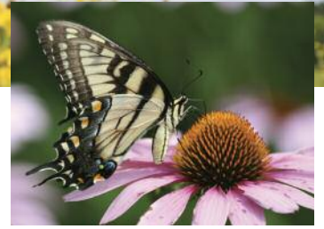
Eastern Tiger Swallowtail on Coneflower