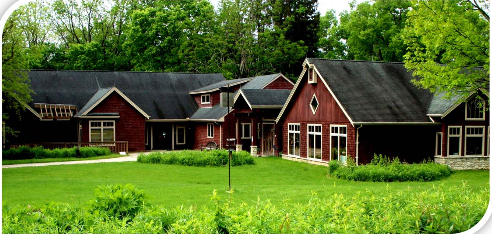
Aullwood Nature Center