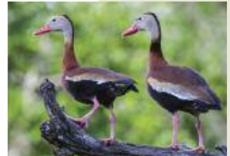
Black-bellied whistling ducks