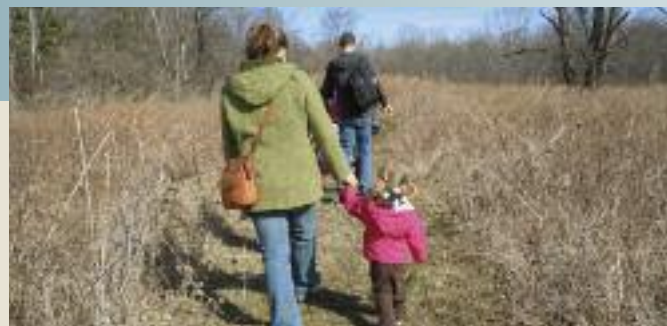
Exploring the prairie