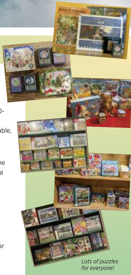
Lots of puzzles for everyone!

Remember, Friends of Aullwood members receive a 10% discount.