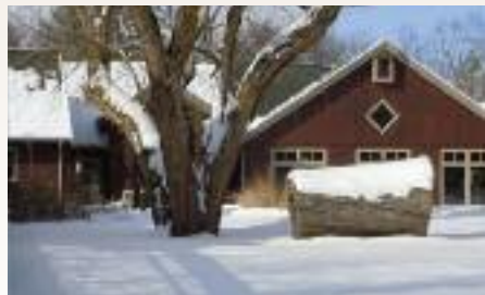
Aullwood Center in snowy beauty