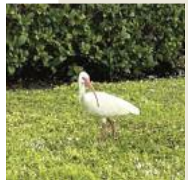
An ibis at Starbucks