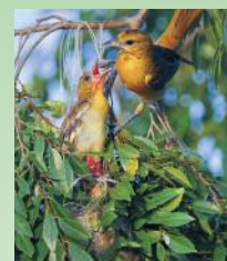
Baltimore orioles.

We hope you experience the spark of viewing not only Baltimore orioles, but other migratory neo-tropical migrants that call Aullwood home!