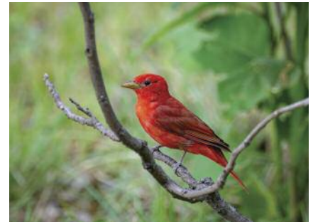
Summer tanager.