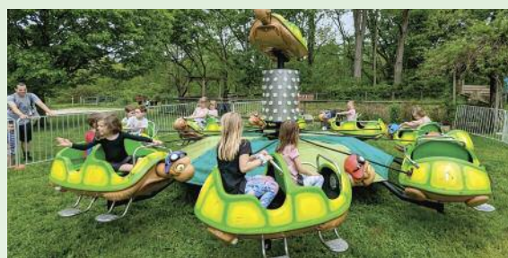
Turtle Parade Ride at Farm Babies Fest 2023