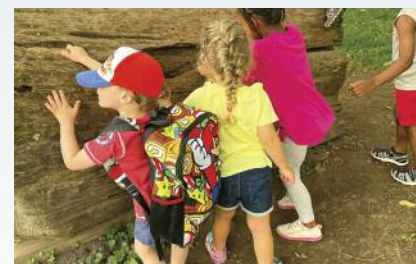
Children at SEA

Sessions of Aullwood's week-long Summer Earth Adventures nature day camps for children ages 4 to 12 run through August 11. Join us for new classes loaded with outdoor exploration and fun! See page 5 for details or visit https://aullwood.audubon.org/SEA