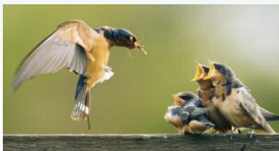
Barn swallow and young

Thursdays, August 3, 10, 17, 24, 31: 8:00-9:00 a.m. Enjoy a naturalist-led weekly walk along Aullwood's trails to explore the fascinating seasonal changes unfolding across Aullwood. Binoculars recommended; members only. (Center)