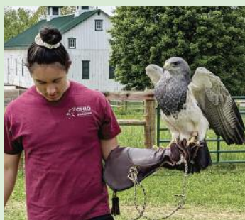
Bird of Prey with handler