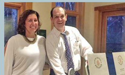
Enjoy a taste with us!