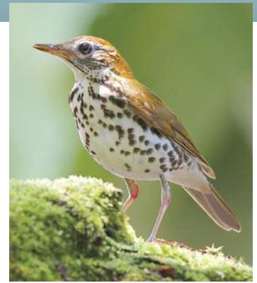
Wood thrush.