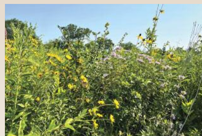
Prairie in bloom

Thursdays, July 6, 13, 20, 27: 8:00-9:00 a.m. Enjoy a naturalist-led weekly walk along Aullwood's trails to explore the wonderful seasonal changes taking place at Aullwood. Binoculars recommended; members only. (Center)