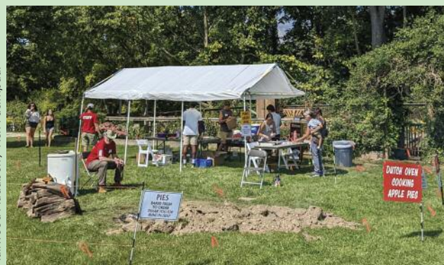
Aullwood Farm.

Please see our website for additional details on ordering and pickup times. Get a warm and cozy home-made taste of fall to take home by ordering early!