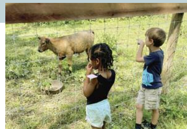
Meeting a friend at Aullwood Farm