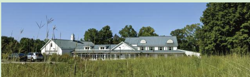
Aullwood Farm — August 2021