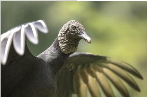
Black vulture.