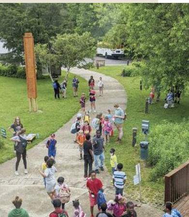
Children arriving at SEA