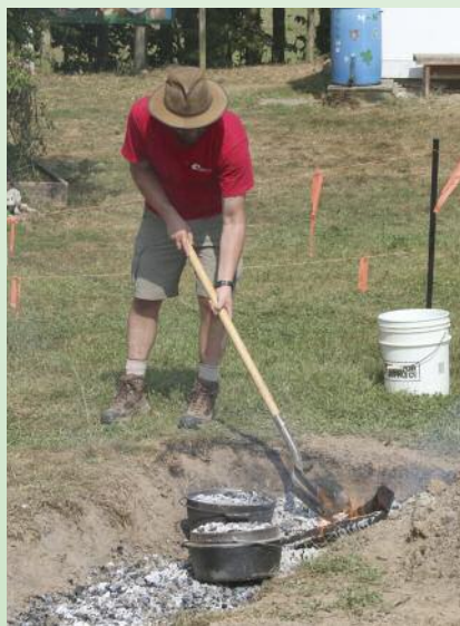
Aullwood Farm.