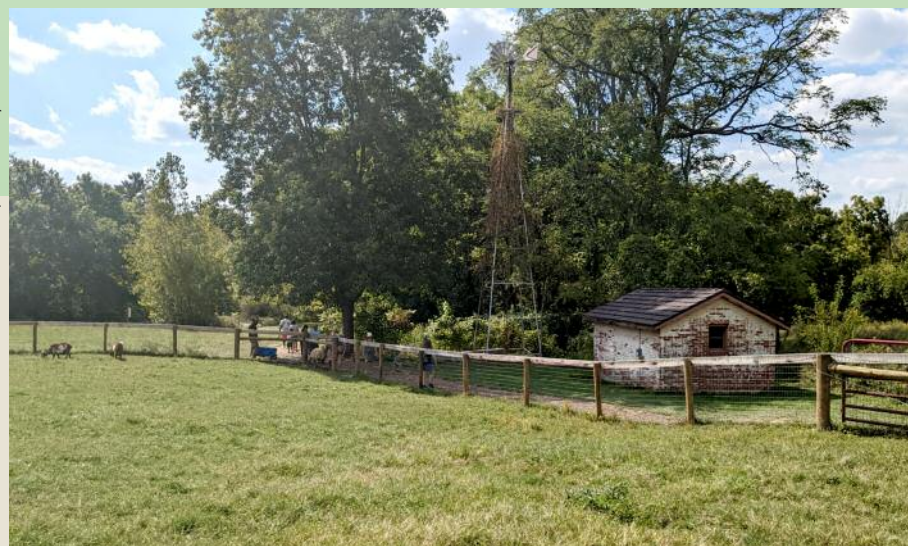
Aullwood Farm.

Not a member? Visit our website at https://aullwood.audubon.org/membership for information on becoming one, stop by our front desk during regular business hours, or call us at 937-890-7360.