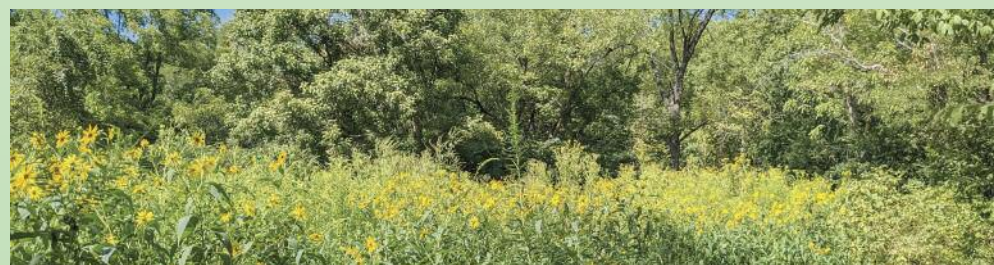
Fall landscape at Aullwood