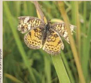
Pearl crescent butterfly