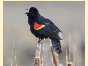
Red-winged blackbird.

Because of you, we were able to raise $2,950 to help Aullwood inspire and reach children of all ages with the wonder of nature, animals and farming! We also appreciate the support of our Birdathon sponsor, Riverdale Optimists.