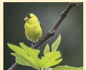
American goldfinch.