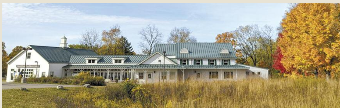
Aullwood Farm October 2020

Wild Birds Unlimited Kettering & Huber Heights