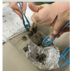
Investigating an owl pellet