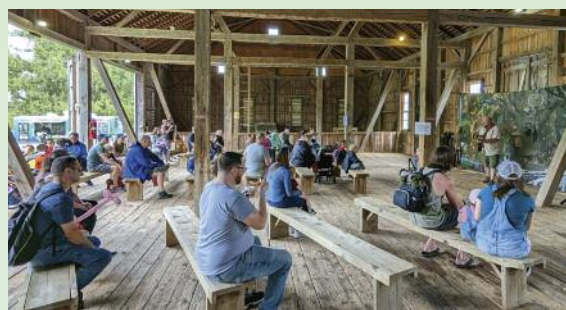
Bank Barn Concert at Farm Babies Fest 2023