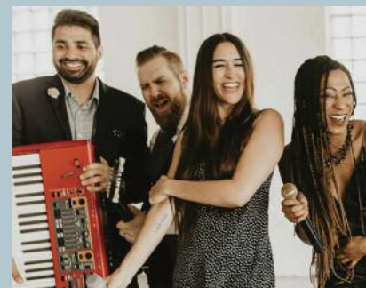
Bluewater Kings Band