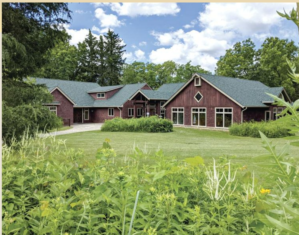
Aullwood Nature Center