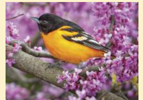
Baltimore oriole.