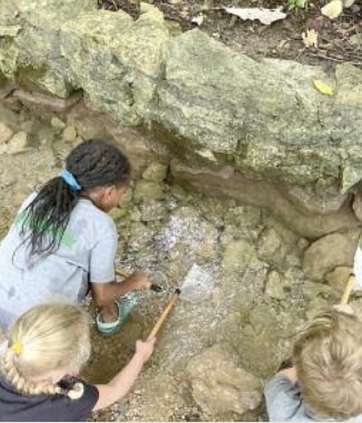
Looking for life in the water