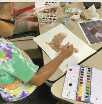
Making avian art at SEA