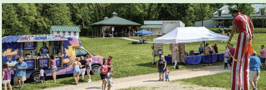
Stilt walker and Farm Babies Fest festival grounds