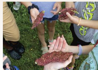
Children exploring nature at a SEA class

Sessions of Aullwood's week-long Summer Earth Adventures nature day camps for children ages 4 to 12 run through August 11. Join us for new classes loaded with outdoor exploration and fun! See page 5 for details or visit https://aullwood.audubon.org/SEA