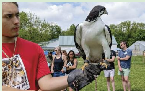
African Auger buzzard watches crowd