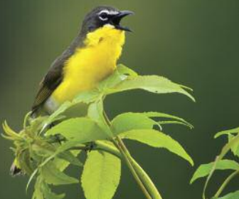
Yellow-breasted chat.

Some noteworthy species discovered to be nesting on Aullwood’s property during past Breeding Bird Surveys include Yellow-breasted chat, Great horned owl, Orchard oriole, Yellow-throated vireo, Northern parula, Wood thrush, Yellow-billed cuckoo, American woodcock and Summer tanager. Information and data like this are critical to conservation efforts in our region, as it can help us identify and create appropriate actions to support bird populations, especially those that may be approaching critically low levels.