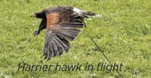
Harrier hawk in flight