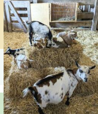
Goat kids and mom

After a little early rain, it was a beautiful weekend full of babies, birds, rides and family time at the farm. Classic children's activities and wagon rides joined new attractions like the free flying raptors of the Ohio School of Falconry's Raptor Roadshow. Cincinnati Circus performers made balloon animals and walked on stilts, the new Turtle Parade ride was a popular attraction, and of course the antics of goat kids and baby lambs amused one and all. Wonderful craft and food vendors as well as the Greenview Garden Club Plant Sale rounded out a great weekend!