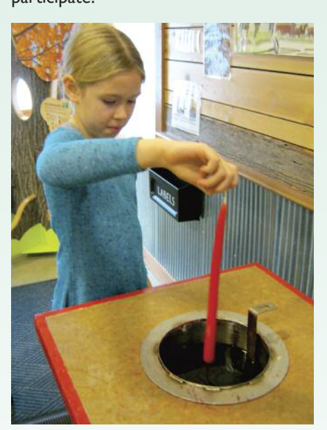
Child dipping candle

Candle Dipping (Everyone) December 4, 5, 11, 12, 18, 19 – 2:30-3:30 p.m. This fun hands-on activity is back for the holiday season. Choose to make a red and/or blue candle – they make a special gift for anyone. This program is limited to 20 participants per session; meet in the lobby of the Farm Discovery Center. Everyone must pay $3 for each 100% beeswax candle made. Admission is free for members of Aullwood, NAS and ANCA; non-members may register and pay our general admission prices to participate.