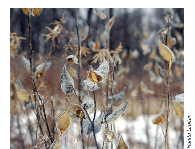
Milkweed in winter

Flowers, stems, berries and leaves left in place means that winter food sources are more available for birds. Creatures sheltering in leaf litter and plants may be found by foraging birds in search of protein-rich food. Clumps of intact plants