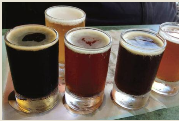
Sample locally-brewed beer