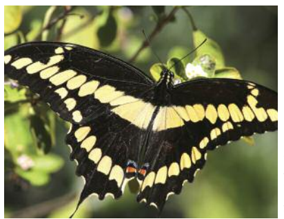
Giant swallowtail butterfly