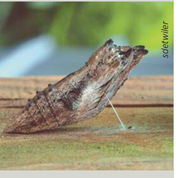
Black swallowtail chrysalis