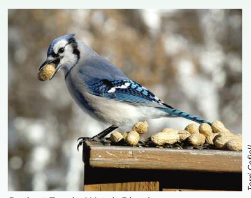
Project FeederWatch Blue jay

(Members) December 2, 9, 16, 23 – 8:00-9:30 a.m. – These walks are for Aullwood and National Audubon Society members only. Explore Aullwood's trails searching for birds and other nature finds! Binoculars recommended. Please be ready and waiting on the main sidewalk of the Nature Center at least 5 minutes before the scheduled start of the walk. The walk starts promptly at the scheduled start time and ends promptly at the scheduled end time. Adult Discovery Walks are a benefit for members and there is no cost to attend.