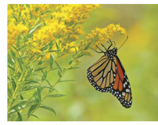
Monarch on Goldenrod

Bald eagle. ((Haliaeetus leucocephalus)).