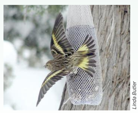
Project FeederWatch, Pine siskin