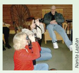
Project FeederWatch volunteers

We're expecting to see a large increase in visitors over the next year, so we're building up our Guest Services Team. These important volunteers are the first interaction guests have with Aullwood. Guest Services volunteers check in members, ring up admissions and purchases in the nature store and process memberships. It's a wonderful opportunity to meet new people and show off our facility. Ideally, we'd like to have one more person per shift to work alongside our veteran Guest Services volunteers. Shifts are Mon. through Sat. from 9:00 a.m.-12:00 p.m. and 1:00-5:00 p.m. and Sun. from 1:00-5:00 p.m. Volunteers should be comfortable with computers, electronic cash registers and credit card machines.