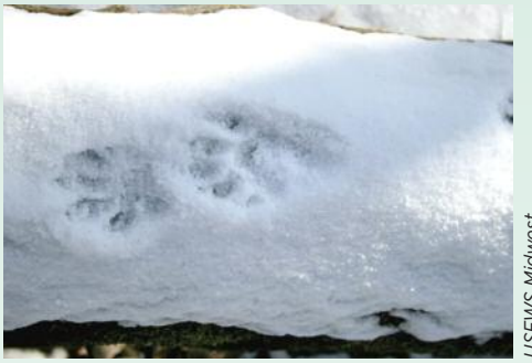
Racoon tracks in the snow

Hunt sheet at either the Center or the Farm and choose your trail. Enjoy the cold as you find objects pictured on this winter list. Welcome winter!